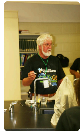
2009 Guam 1st Forensic Science Symposium Break Out Session Counting Maggots