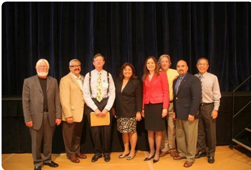
2011 Friends of the Crime Lab Panelists