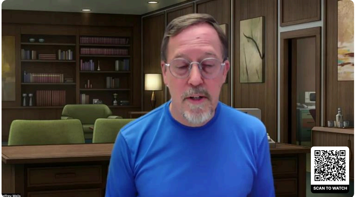
Statement recorded for the North American Forensic Entomology Association conference. June 2023.